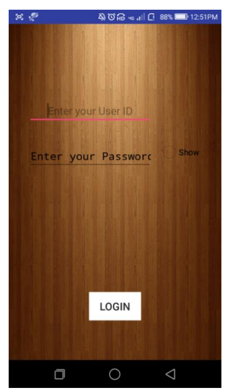
Fig 5. Log in Details

If you are an existing user, you need to log in.