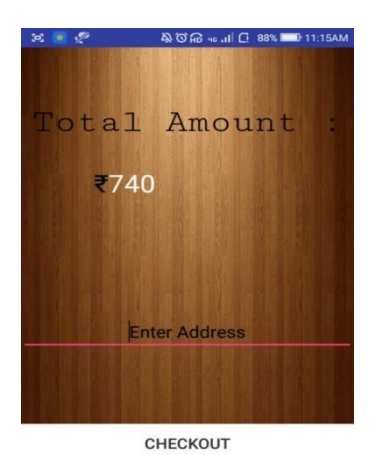
Fig 8. Address

Total amount is displayed. User needs to enter his address.