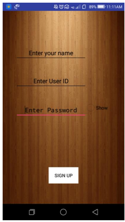
Fig 4. Sign up Details

If you are an existing user, you need to log in.