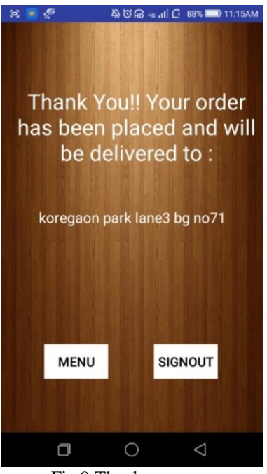
Fig 9.Thankyou page

Thank you message is displayed, you can either sign out or go back to the menu.