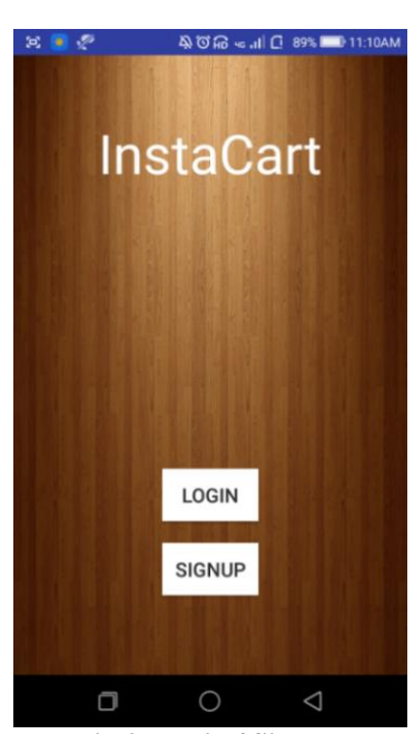
Fig 3. Login / Signup

This is the screen where the new user will have to select the sign up button and the existing user will have to select the log in button.