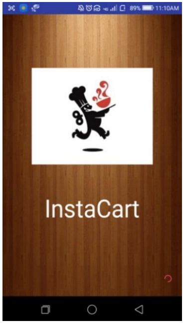
Fig 2. Welcome Page

This is the first page of our application. This screen is a splash screen which will be displayed for 4 seconds.