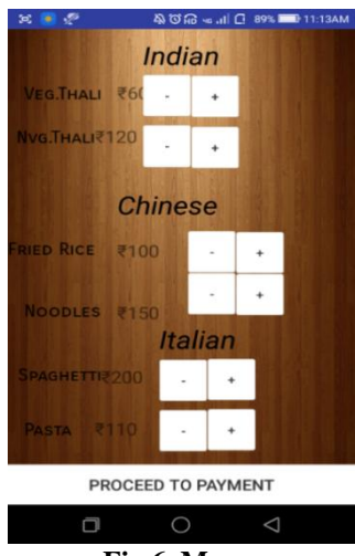
Fig 6. Menu

Total amount is displayed. User needs to enter his address.